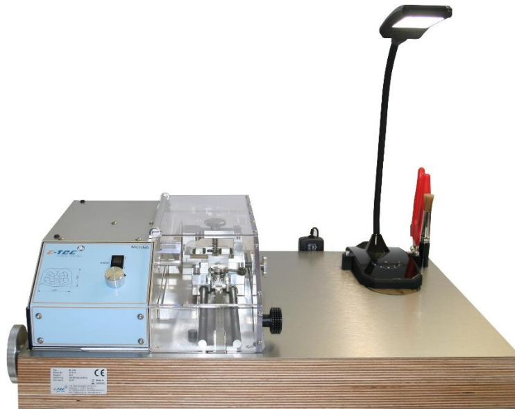
ML 3300 for precise cutting and grinding of electrical crimp connections

The preparation and examination of microsections of electrical crimp connections for quality assurance reasons is nowadays state-of-the-art. In order to meet customer requirements best, we offer besides our micrograph laboratories also single functional modules. This allows customers to design their labs individually or to complement and modernize their existing laboratories. Of course, all C-tec modules are compatible to each other!