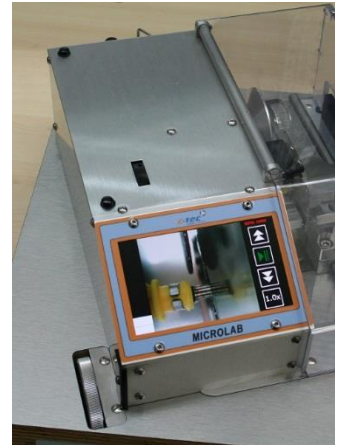
Cut control with an optional Visual Cut Camera (VCS)