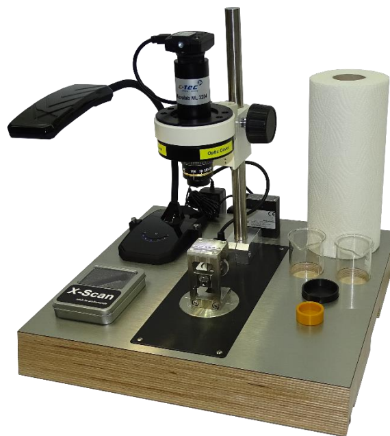
Optic station ML 3204 with 4x zoom

The proven optic station ML 3204 has four optical zoom levels and an excellent colour digital camera. Due to the good price-performance ratio, this measuring microscope is also interesting for occasional use.