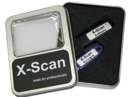
Inclusive evaluation software X-Scan