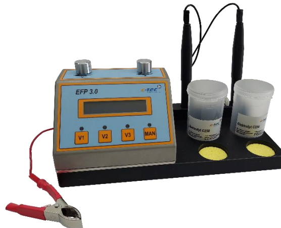
Electronic fine polishing unit EFP 3.0, here with sample holder Screwfix and add-on crocodile clip

The workflow management of the crimping process is important for the quality of crimp connections. Hidden defects of material or incorrect setting of the crimping machine or tool can result in serious defects in the crimp connection and lead to substantial failures of the wire harness. Claims for compensation and/or loss of face can be the result.