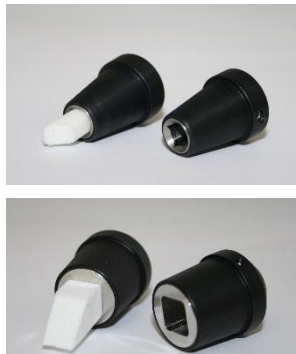
Polishing tips and fixtures are available in sizes 4.6mm and 10.1 mm