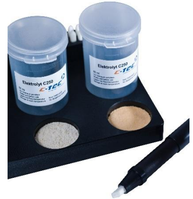
Non-hazardous polishing liquid C250 for excellent microsection pictures