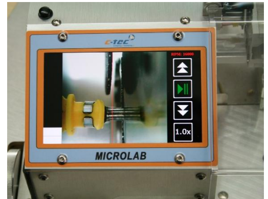
Cut control with an optional Visual Cut Camera (VCS)