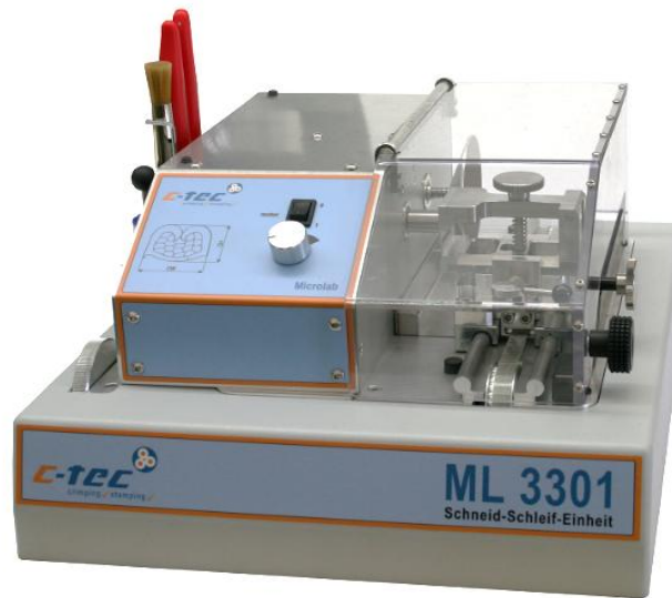
ML 3301 cutting and grinding unit integrated in an aluminum housing

With the cutting and grinding unit ML 3301 , crimp connections can be cut and ground very accurately. The metal saw blade enables a precise cut.