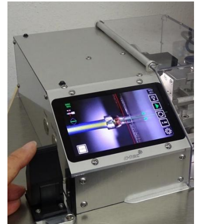
JDS Drive System incl. Visual Cut Camera (VCS)