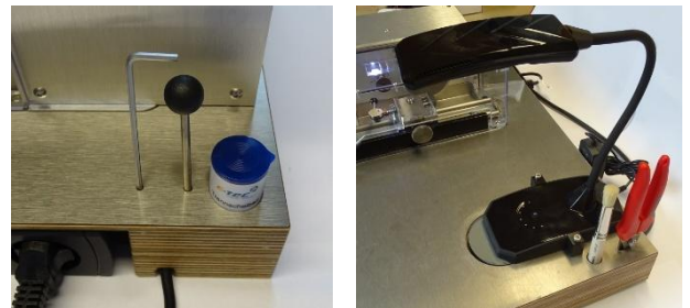
Full set of tools and accessories