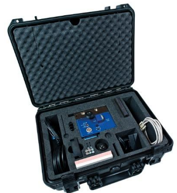
Robust case – protected from splash water and dust