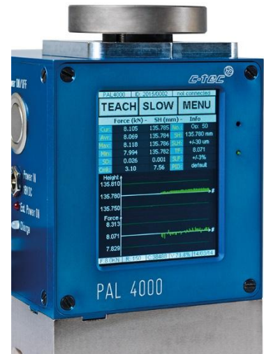
Presentation of the measurement results